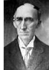
Author Wallace Delois Wattles

Remember that the Science of Being Well claims to be a complete and sufficient guide in every particular. Concentrate upon the way of thinking and act-